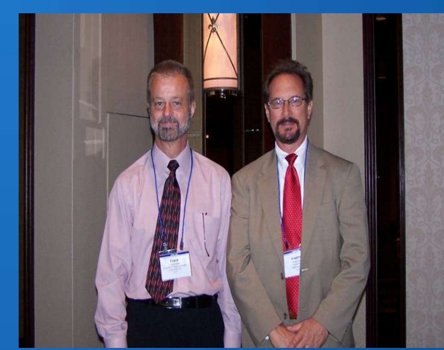
At the opening